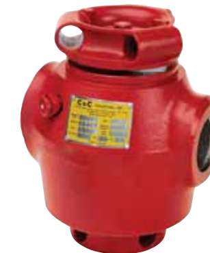
2"x 2" Female 10,000 WP 15,000 Tested Line Pipe Connection Bore Size 2.06" Standard Service