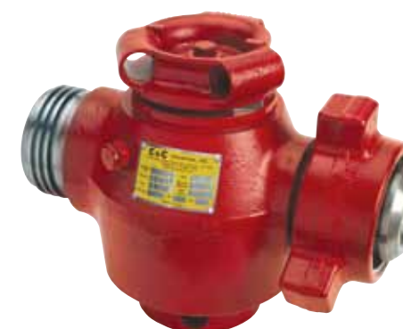
2"x 2" M/F 15,000 WP 22,500 Tested Integral W/1502 Union Connection Bore Size 2.06" Standard Service

competitively priced to position themselves among the most desirable quarter turn high performance valves in the market.