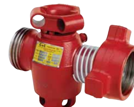
1"x 2" M/F 15,000 WP 22,500 Tested Integral W/1502 Union Connection Bore Size 1" Standard Service